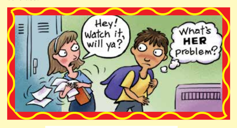
© 2015 Free Spirit Publishing. All rights reserved.

If someone accidentally bumps into you on the way to class: