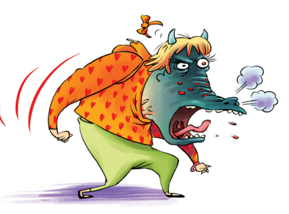
© 2015 Free Spirit Publishing. All rights reserved.

No matter who you are, anger can make you feel like a real monster.