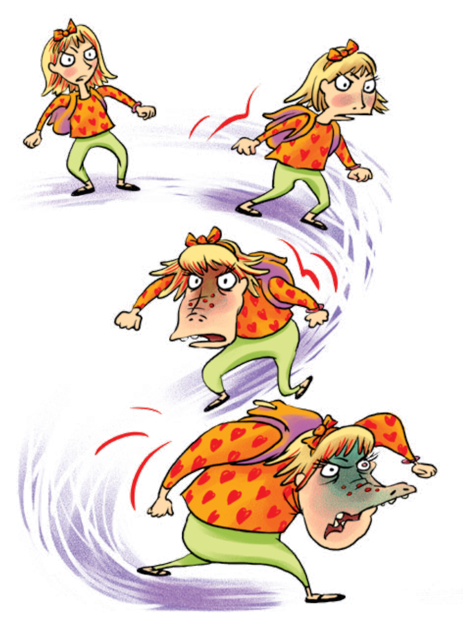
© 2015 Free Spirit Publishing. All rights reserved.