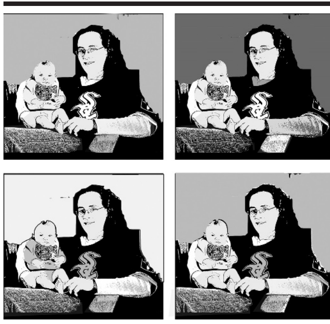
Figure Activity 1.11-1. Pop Art Photo Tints