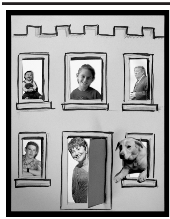
Figure Activity 1.18-1. The People I Live With